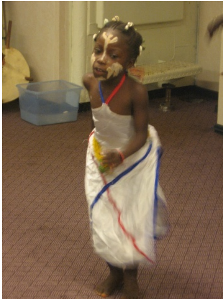
(Photo of a Liberian child doing a traditional Liberian dance most probably from the Kpelle, Gola, or Vai ethnic groups of Liberia. During the war UNICEF and DATI used culture to promote peace, disarmament, and demobilization of Liberia’s former combatants and child soldiers.)

soldiers through the UNICEF/DATI Kukatonon Conflict Resolution Project, the “Mardea” Radio Drama Series that advocated the cause of women empowerment and gender equity; as well as a public information campaign traveling theatre production entitled, “Wheh-gba” that was focused on HIV/AIDS prevention from 1992 up to my departure in 1997 when those whose “mas and pas Charles Taylor killed” decided to vote him in office.