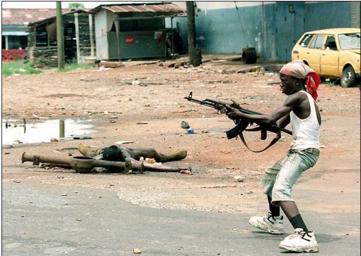
(A Liberian rebel child soldier in action)

most of the adults who were available to provide our children with supervision molested, abused, and ill-advised African and Liberian children to commit crimes and abuse drugs. In other words, children were used as scapegoats to accomplish their warlords' impulsive tendencies.