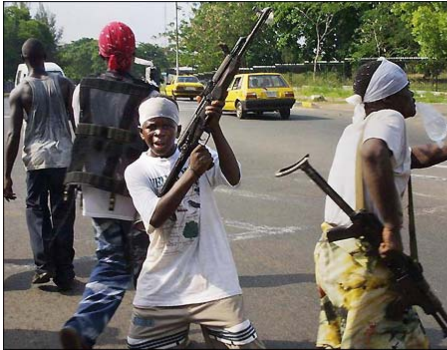
(Above, Liberian child soldiers set up road block and go on the rampage.)

The next concern I want to raise in this text has to do with Liberian politicians and former warlords using children to promote their selfish political agendas. As a result, many Liberian children died in the war and many were made orphans; others sustained lifetime injuries that have disabled their cognitive, emotional, and behavioral capacities to make informed decisions on their own and to be able to fend for themselves and their surviving family members. Also, former child soldiers were denied access to education, a safe environment, and good medical facilities; and above all, a productive childhood experience. Instead, Liberian warlords and some politicians took advantage of the youthfulness of Liberian children by influencing them to engage in wanton killings and destruction of properties. Against this backdrop, our children's lives were completely wasted over the past two decades, so to speak, because they spent most of their precious youthful days fighting battles for their warlords when they could have been