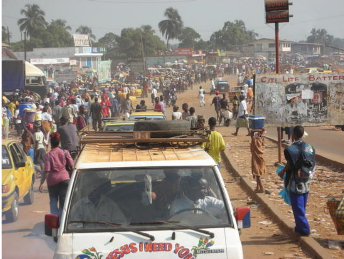
(A busy and congested market site on Bushrod Island, Monrovia)

However, as the situation exists on the ground today, most post-conflict Liberians are generally living under duress because of the conflict resolution arrangements that were made by the international community and Liberian warlords to resolve the Liberian conflict. In view of the abovementioned, the process of rehabilitation for former combatants and Liberian civilians is a must, because Liberians in general have their apprehensions first of all about the current President of Liberia and her involvement in abetting rebellious and treasonous acts against the government and people of Liberia. Liberian civilians also fear the unpredictable moods of children (now adults in their mid and late twenties) who shot and killed their loved ones. In this light, Liberian civilians need to be assured that the so-called 'disarmed' former combatants and child soldiers might not snap at them and resume their killing spree once again. And, if they snapped, it is likely that they may not be punished because their former warlords are still holding