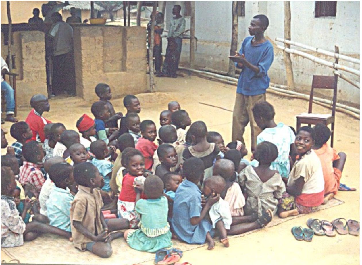
(Above, Liberian children get their first opportunity to attend a make-shift school in the village after more than fourteen years of civil blood bath. Children were victims and they were targeted as combatants and child soldiers)

Based on the effect of the Liberian civil war, the drop out rate in Liberian schools and elsewhere in Africa has quadrupled and illiteracy rate has sky rocketed. This high drop out rate principally stems from the recruitment of African children in armed conflicts throughout Africa, as well as the lack of adequate educational facilities in Liberia. Also, due to the present post-war economic crisis in Liberia, most of the young people struggle to earn their daily bread by brushing their aging parents' farms in order to produce food to eat and survive. Against this light,