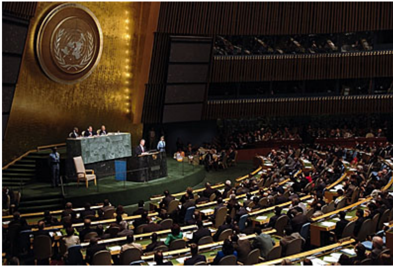
(The United Nations General Assembly in session)

The impact of conflict resolution deals in Liberia cannot be overly emphasized because conflict resolution policies affect the way how post-conflict citizens govern themselves after a protracted period of war and self-destruction. For instance, in the Liberian peace deal, it was agreed that rebel leaders would participate in the electoral process and hold prominent posts in government. This portion of the agreement reflects that negotiators succumbed to the caprices of Liberian warlords who purposely insisted that they participate in the electoral process in order to secure their lives after destroying the lives of their fellow compatriots. Subsequently, peace negotiators, as well as those who ‘represented’ civilians’ interest at peace conferences conceded to the whims and caprices of rebel leaders and gave them the ‘green light’ to think their actions were justified. In effect, it gave perpetrators of injustice and mayhem reason to have no remorse of conscience for what they did to the Liberian people because they were entrusted not only with the security and safety of those whose massacre they orchestrated during the war; but also, rebel leaders now have been entrusted with the economic and natural resources of Liberia so that they