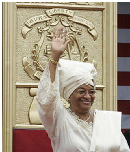
(Mrs. Ellen Johnson-Sirleaf, incumbent President of Liberia)

In reaction to the socio-cultural and political concerns narrated above, the Liberian government must act immediately to indict former Liberian warlords or rebel leaders for the dreadful crimes they committed. In addition, the Sirleaf government should also seek to address the mental health and learning needs of former combatants so that they may receive psychiatric and psychological treatments; learn new trades, and successfully reintegrate into mainstream society without hardships. However as things stand, former combatants and child soldiers now experience great anxiety to get reaccepted into mainstream society by the very people they tormented with their guns as rebel fighters. In this light, it may be safe to note that no aggressive