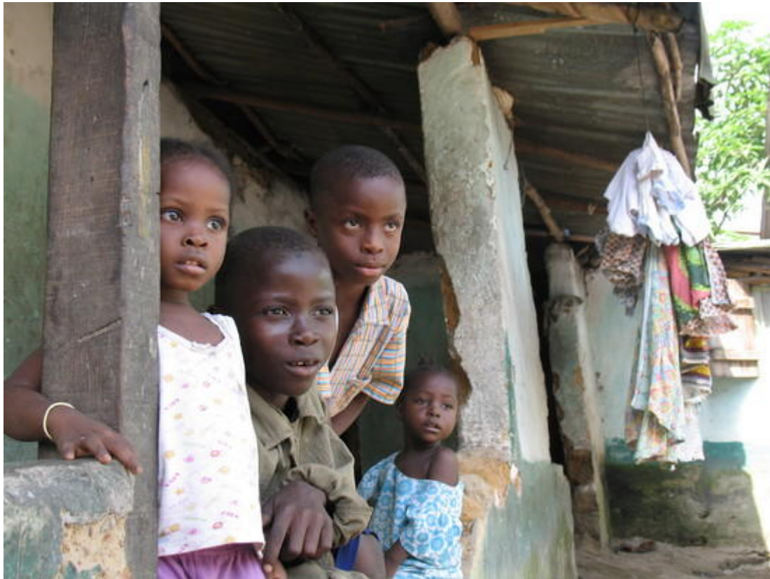
(Above are some orphaned and abandoned Liberian children during the civil war)

pursue their cause during the various peace treaties that were carved to end the war in Liberia. Also, the initiative taken by UNICEF, myself, and other patriotic Liberians to advocate on behalf of Liberia's child soldiers was a drop in the bucket at that time since most of the international community's resources were being pumped into finding ways to stop the carnage and sponsoring peace conferences to bring belligerent parties to the negotiation table. Accordingly, this may be one of the reasons why the issue of properly rehabilitating former Liberian combatants and child soldiers has not been adequately addressed as it should at this time in Liberia.