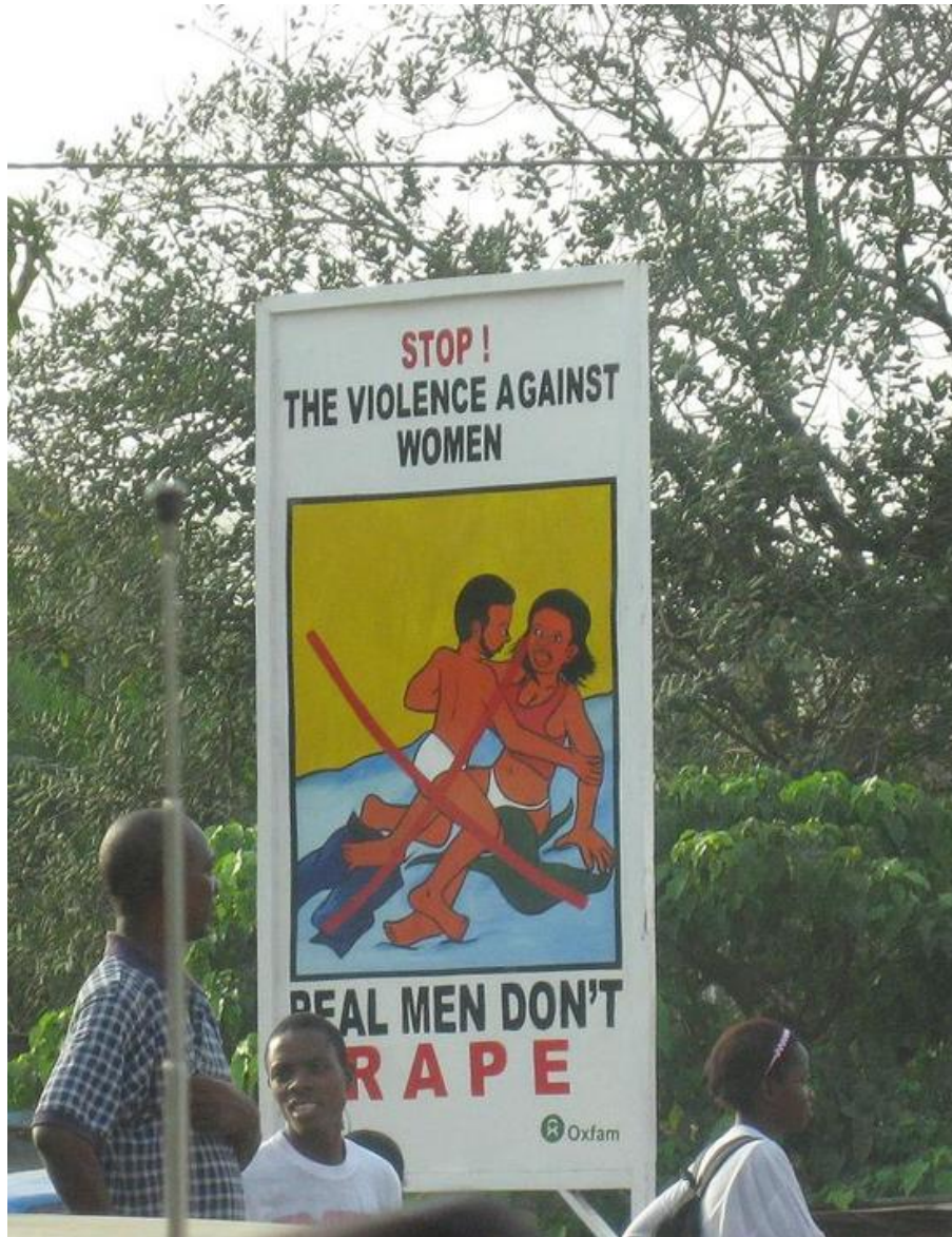
A Local Sign in Monrovia, the capital of Liberia, advocating the rights of women during the Liberian Civil War.

In view of the foregoing, it is my ardent hope that the message contained in this text will not be misconstrued as a negative political campaign against the present government in Liberia. Instead, I hope my efforts to provide a divergent and analytical perspective regarding the plight of former Liberian combatants and child soldiers and the present political arrangements in Liberia may be viewed as a patriotic gesture on my part to help find more lasting and genuine solutions regarding the security of all Liberians, and not security for just only a few Liberians.