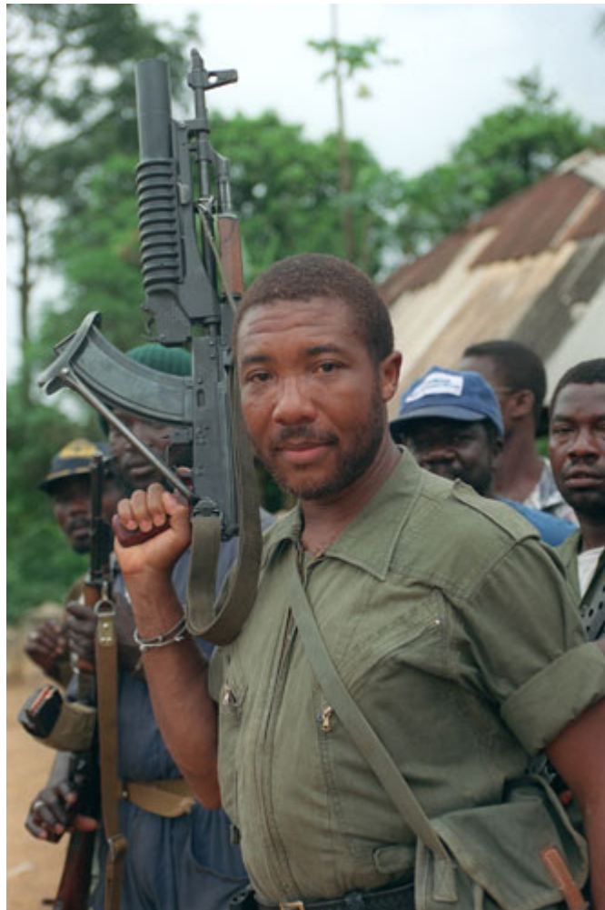
(Former Liberian rebel leader Charles Taylor Being tried at the International Court of Justice in The Hague.)

In my own view as a student of behavior modification and applied behavior analysis, Africa in general, and Liberia in particular, can regain her credibility as a law-abiding society by bringing all former African and Liberian warlords to justice under the dictates of the