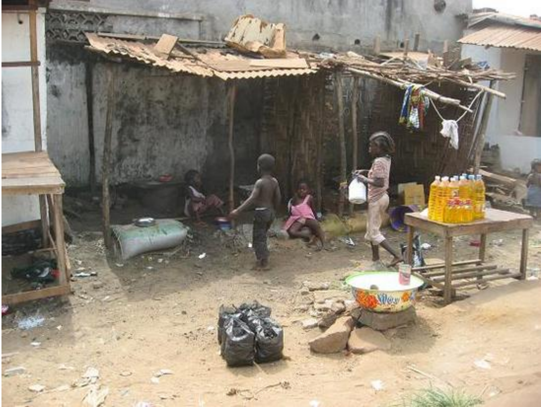
(Orphaned and abandoned Liberian children fending for themselves during the Liberian Civil War.)